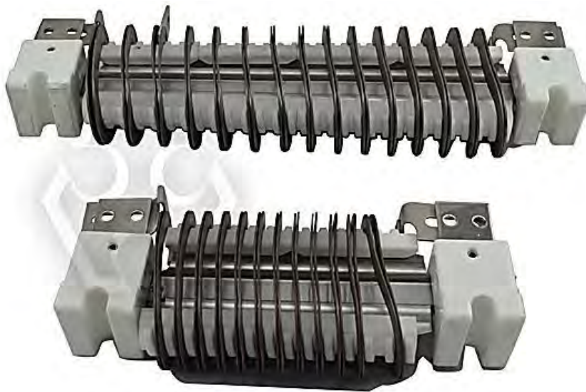
High Current Oval Edge-Wound (DOE)